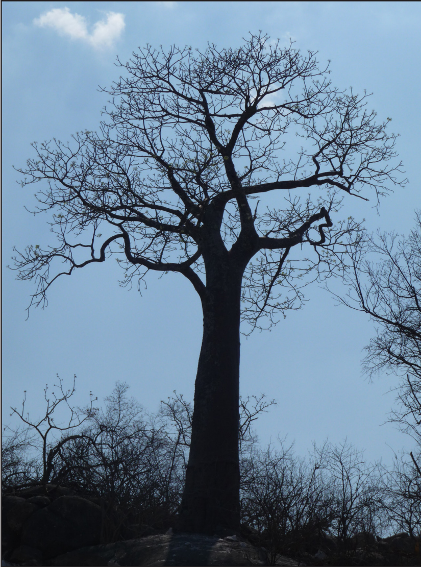
Farai nguva dzose; rambai muchinyengetera 1 Vatesaronika 5:16-17